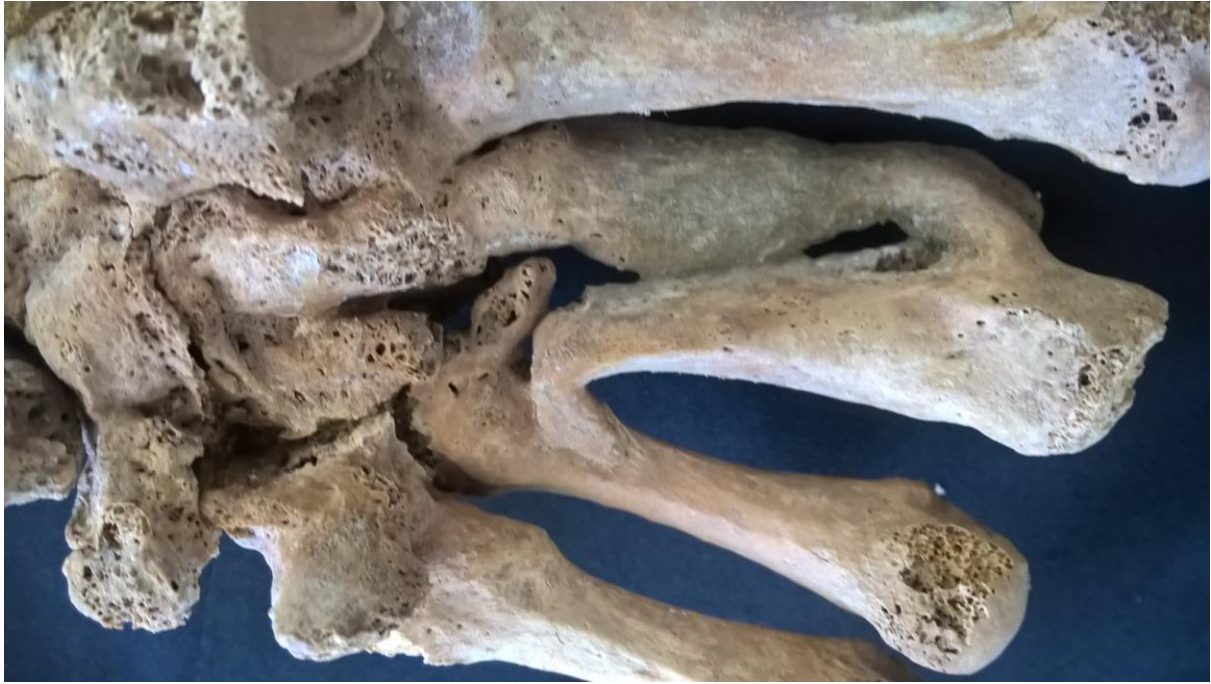
Figure 3: Detail showing the bony bridges at the base of metacarpal bones.

This infection may have been the result of an open fracture with proximal extension and septic arthritis of the wrist. There are signs of periostitis, deformity and fusion of carpal bones and the distal radial epiphysis in a single mass ( Figure 4A and B ). Scaphoid bone is fused in a 30° angle. There are signs of arthrosis of the distal cubital epiphysis. Pronosupination seems to have been very limited.