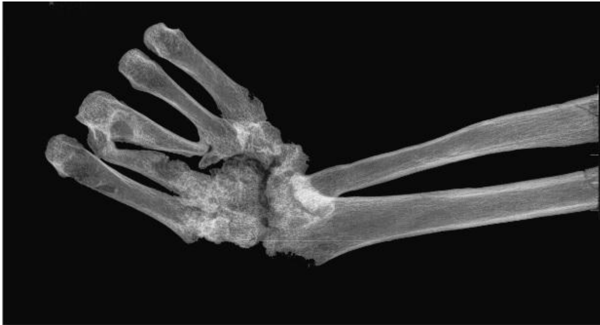
Figure 5: A plain radiography of the specimen.