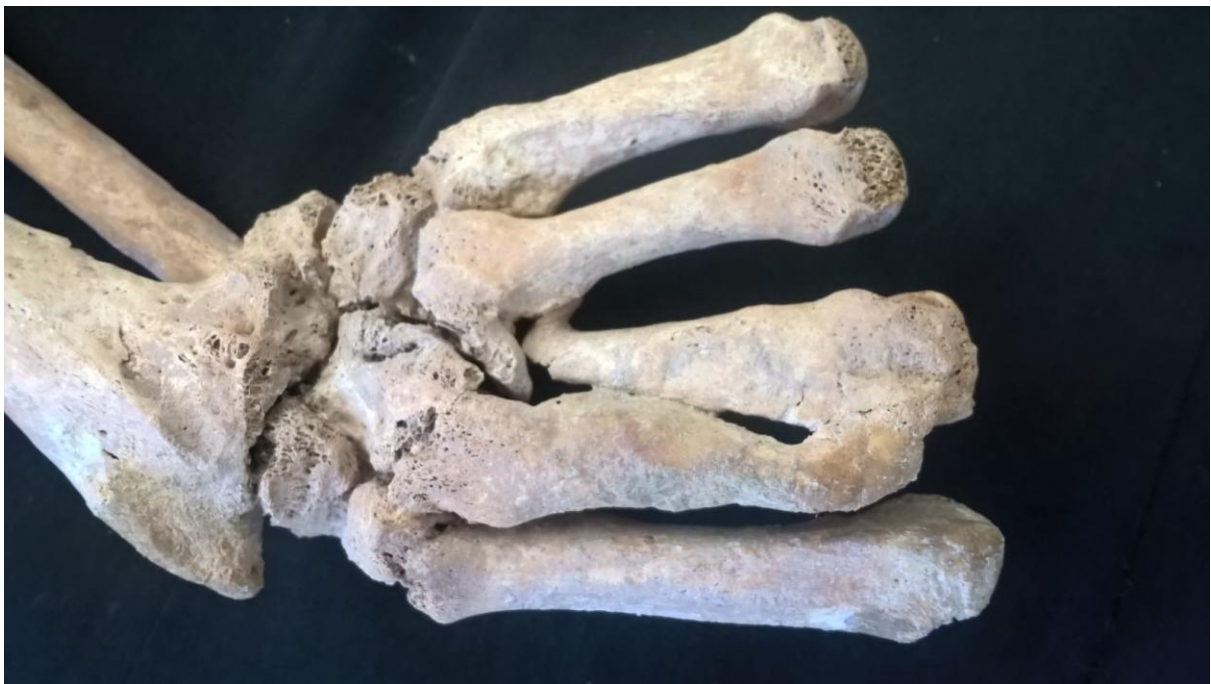
Figure 2A and B: Palmar and dorsal aspect of hand remains.