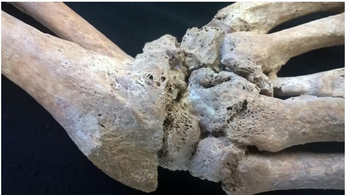
Figure 4A and B: Two details of carpal and wrist involvement.

Radiographic images ( Figure 5 ) show cavities of intraosseous abscesses, fistulous orifices, carpal ankylosis and osseous condensation in the distal radio cubital joint.